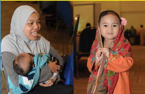
The hand that rocks the cradle rules the world! #mothersrock!