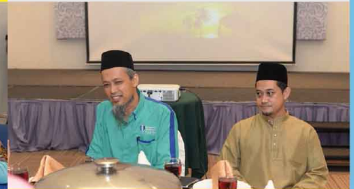
"We don't remember days, we remember moments - Anonymous