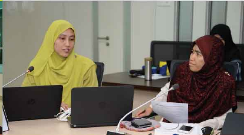
There is no substitute for #hardwork - Thomas A. Edison