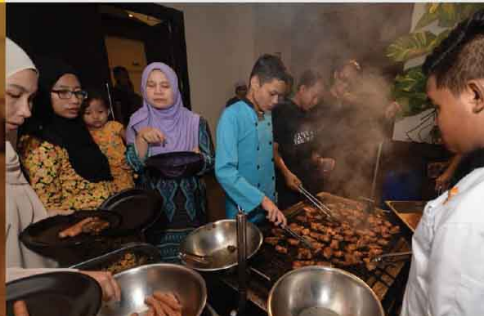
We are on a seafood diet, we see food and we eat it! #foodgalore