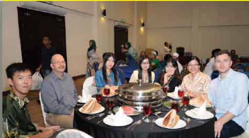
#Goodfriends are like stars