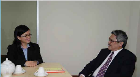
"Great leaders inspire greatness in others" - Anonymous #soaringupwards