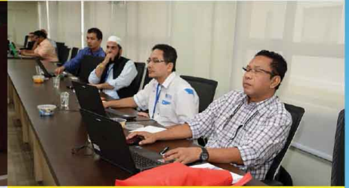
"Alone we can do so little, together we can do so much." -Helen Keller #teamworkatitsbest!