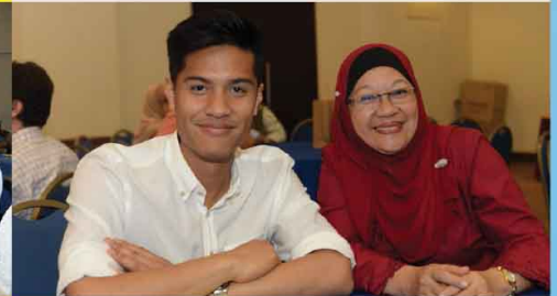
#Smile! It's contagious!