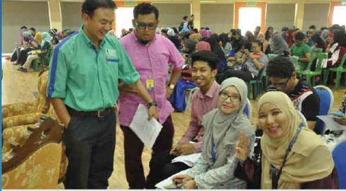
All smiles for the camera! #RCPGambang2016