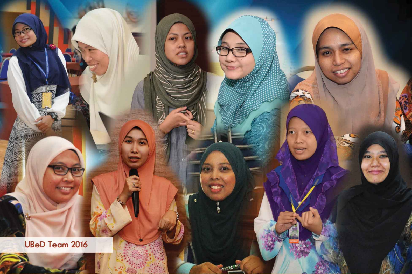
UBeD Team 2016