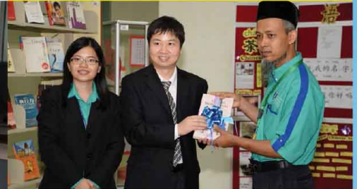
"A leader is one who knows the way, goes the way, and shows the way" - John C. Maxwell