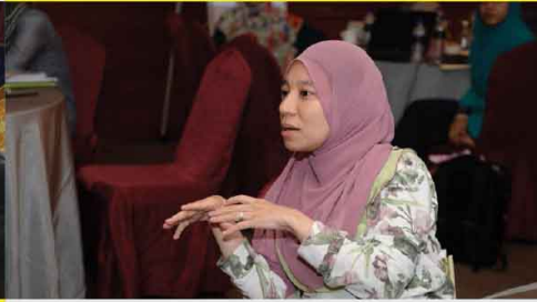
"Leadership is the capacity to translate vision into reality." - Warren Bennis #LeadingByExample