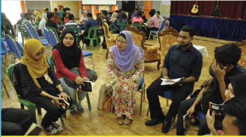
"Whenever you read a good book, somewhere in the world a door opens to allow in more light" - Vera Nazarian #RCPGambang2016