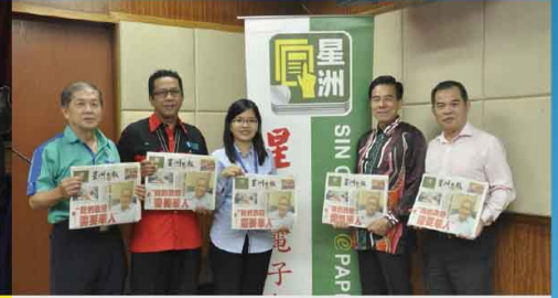
There is no substitute for hard work! #Ganbatte!