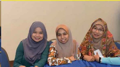
Surround yourself with those who make you #happy