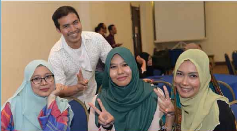
A little magic can take you a long way - Roald Dahl #Peace y'all!