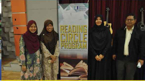
If you can dream it, you can achieve it! #Determination